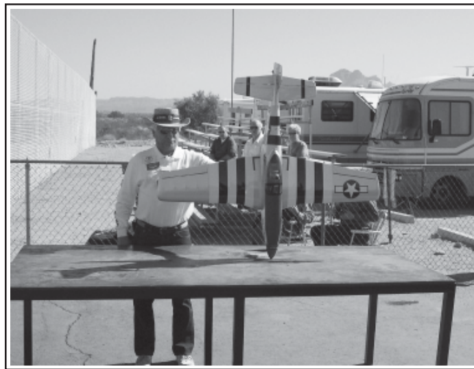
Going through the model placement for the judges. I applied spray paint over the China Kote to replicate the full size P-51. I added an Aces of Iron pilot and some details as well.

I did manage to capture all of the 30 available points for Static judging with good documentation. My first round was