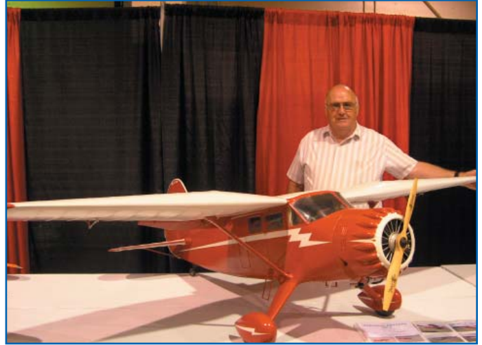
2nd Place & $300.00, a nicely scaled & stitched GP Stinson SR9 Reliant with full interior by Lester (lost last name)