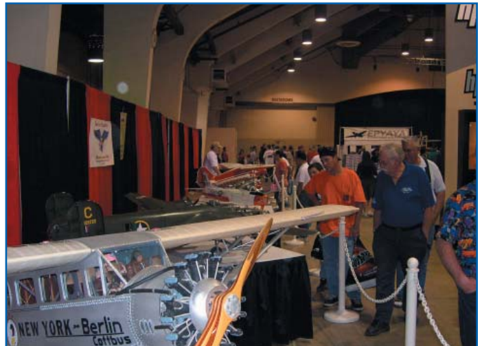
The RC Expo Static line Up was well photographed by the mass of attendees. Next year should be bigger & better.