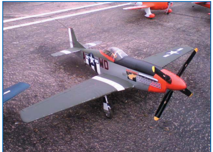
Rick Powers World Models ARF P-51 painted and nicely scaled out. Not sure about those kill markings on the cowl. Help me out here!