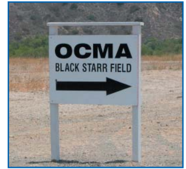
This is the sign you see when you enter the gate. Drive on the gravel perimeter road and do not cut through the open field.

EDF Jet with no difficulty, but with some trim help from Will. That kid is really a good pilot, no matter what he flies.