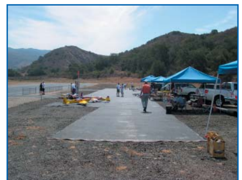
A good view from the extreme end of the pit area. There are two taxiways to the runway.