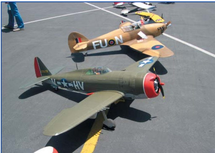
More of the detail applied to giant scale ARFs. This is a growing category and perhaps a good way to get into scale competition.