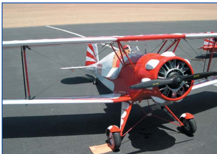
A really nicely detailed Youngmiester. The engine detail was the best at the event. Flew well also, but it did not get the pilot's name.