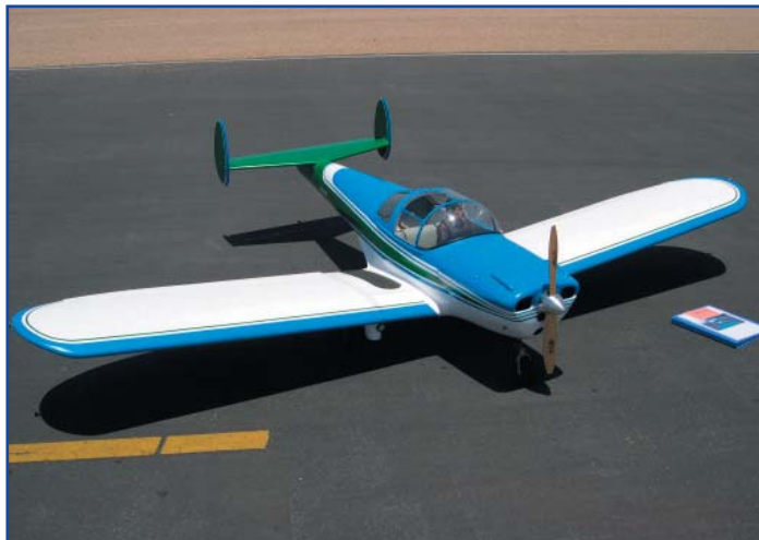
Oscar Wienart's Balsa USA 415C Ercoupe with working brakes, lights and a neat interior. Team Scale Entry with Carl Lindou handling the flying chores.