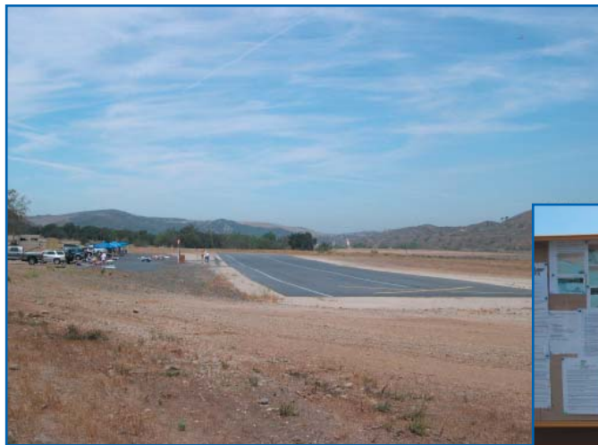
A view from the approach and I had about another 200' behind me. The entrance to the runway is graded so if you land short, you should be OK.