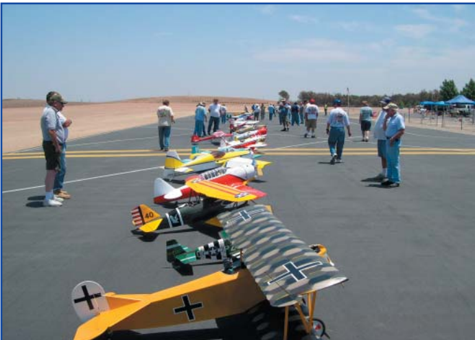
Part of the 61 aircraft that were present at the event. The Prado Field was a great place for our Scale Fun Fly. Support from the PVMAC Members was beyond our expectations.