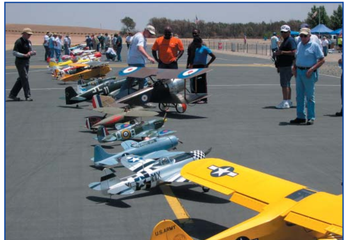
Another shot of the noon time line up on Saturday. A total of 51 pilots attended the event with 22 of the 61 aircraft electric powered. 9 One Eighth members came over from Phoenix