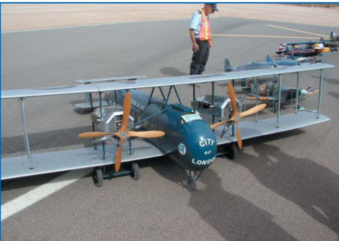
A Huge Vickers Vimy with two gas burners. A full cockpit and interior with drapes and towels. It flew well even with an engine out. The props are static.