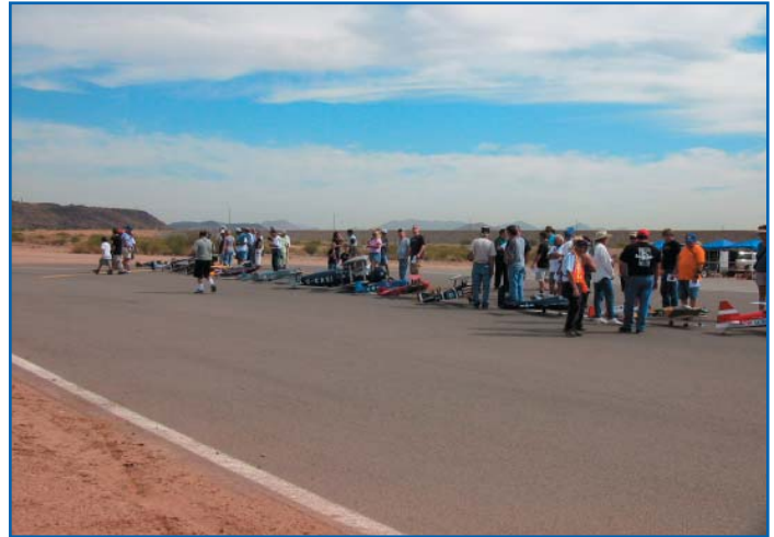
One of the longest lines ever of scale aircraft at the noon break. The availability of camping at the AMPS Field really made this already popular event special.