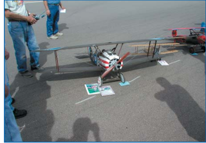
A scratch built colorful WWI scale model. It looked like a Sopwith Pup, but sure was noticed and with good documentation.