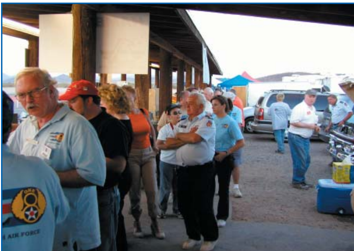
Only part of the line up for BBQ Baby Back Ribs, Seasoned Chicken Breast, Bush Baked Beans, Potato Salad, and cold beer. All for $15.00!