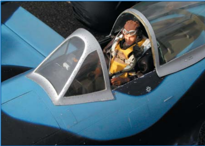
Only part of the fabulous detail on the P-47 Fireball Thunderbolt built by Bob Frey and Dave Gionakos from a Yellow Aircraft kit. It flew as good as it looked.