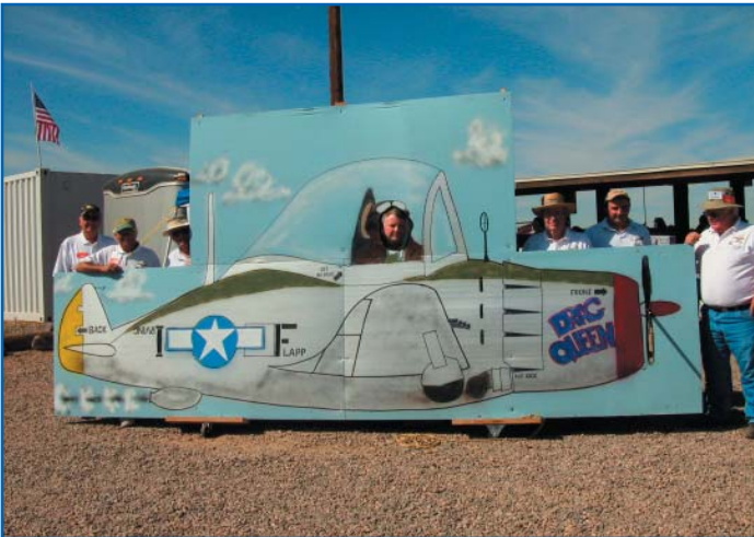
The famous "Drag Queen" P-47 presented by the One Eighth Air Force. We have arranged for this aircraft to be at the hangar for our annual BBQ in January.