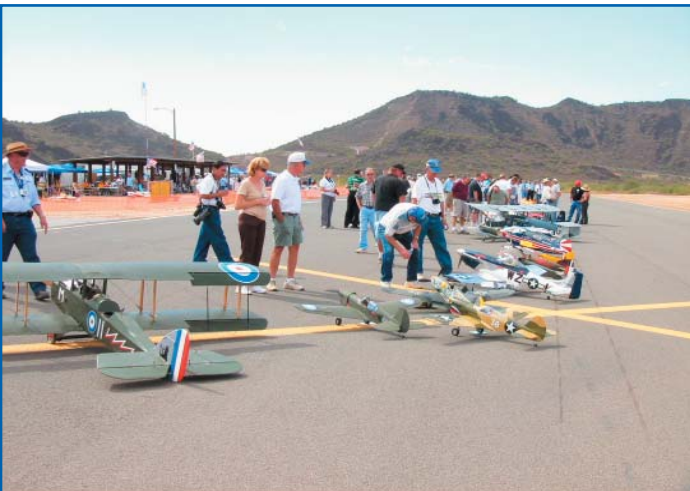
More of the noon line up. This is always a favorite of the crowds and far better than watching a 3D hover! (Just kidding...c'mon guys)