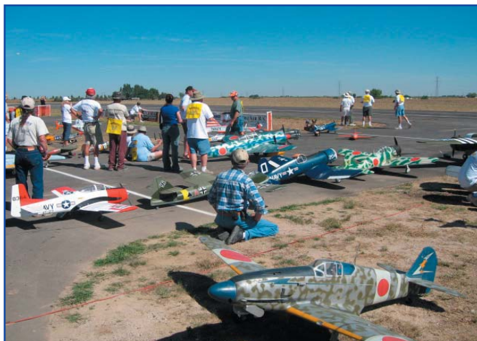
Just a sampling of the more than 175 Warbirds at warbirds Over the Rockies. Non stop for three days with Pyrotechnics, and a full size sea Fury Fly by.