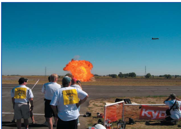
A B-17 leaves the bomb blast at warbirds over the Rockies. You have to get the video. This was a great show with over 135 pilots.