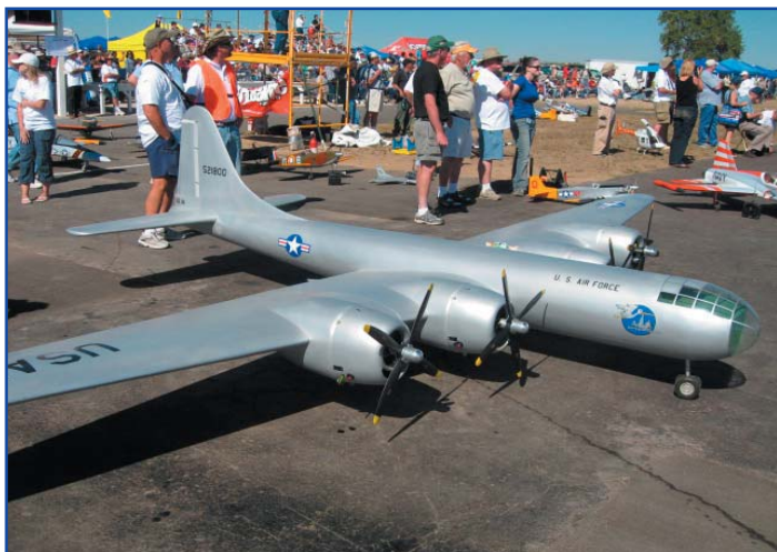
No airshow is complete without Mac Hodges 20' B29 and the X1 demonstration. Dan Stevens flies the little X1. A huge Crowd pleaser too.