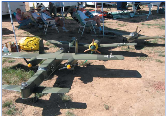
Dan Stevens German warbirds at Warbirds over the Rockies. The single wing in the back is actually a Northrup plane. See video from Propwash Videos.