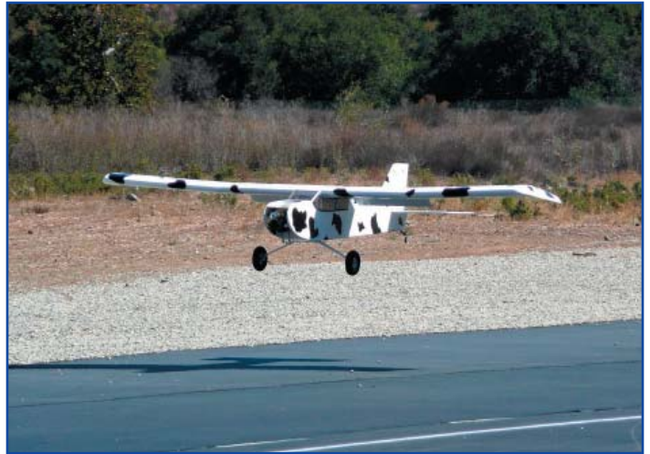
Jim Reed's Big Scale "Got Milk" Cow on approach at Black Starr. Everyone flew this gentle big model including Jim Reed.