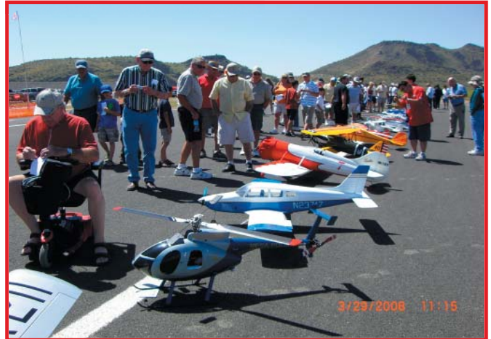
A small shot of the many planes at the One Eighth event. The weather was excellent and everyone from all reports had a great time.