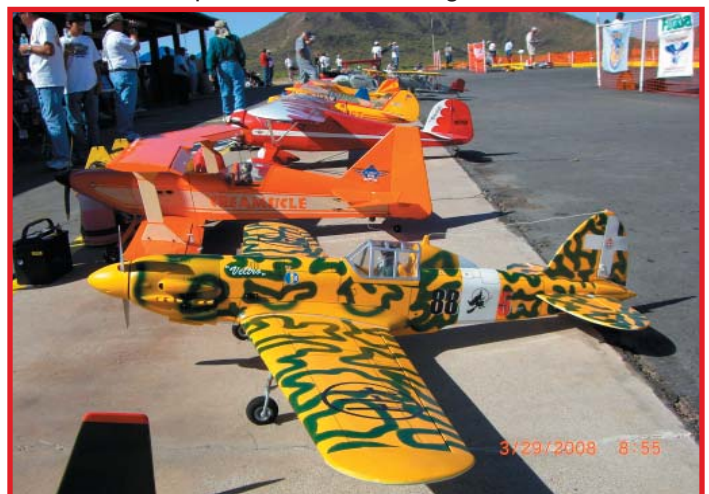
More of the great scale models at the One Eighth event. Don't miss the March event. These guys know how to put on a good, fun, event.