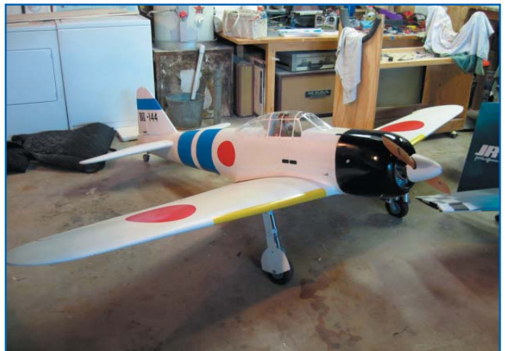
Brian Young at it again with his new 118" Zero. Brian wants to change the paint scheme to a Japanese green color scheme. Powered with a 5.8 First Place Engine.