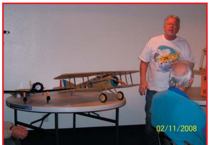
Berf Tunnel and a scratch built electric WW1 bi-plane. Berf is a real artist and it was visible in the paint scheme of the vintage flyer.