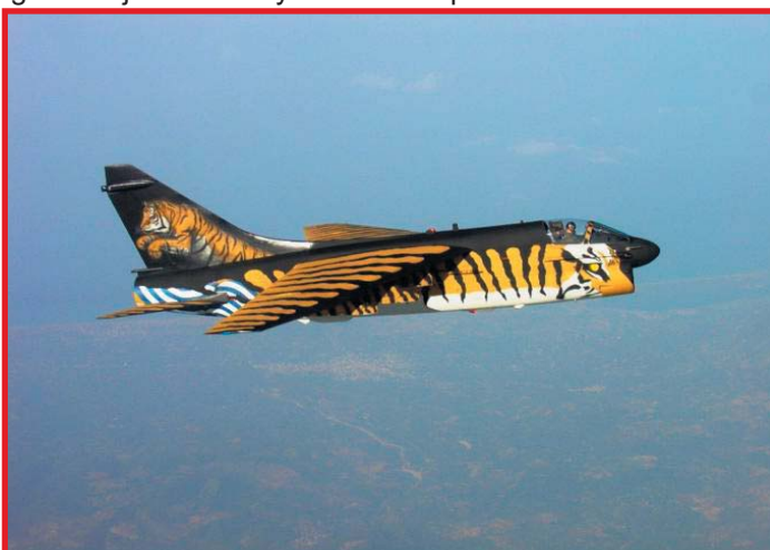
How about a unusual paint scheme for a jet hangar A7 This is the full size on the Tiger bombing competition. Very colorful & hopefully, someone will model it.