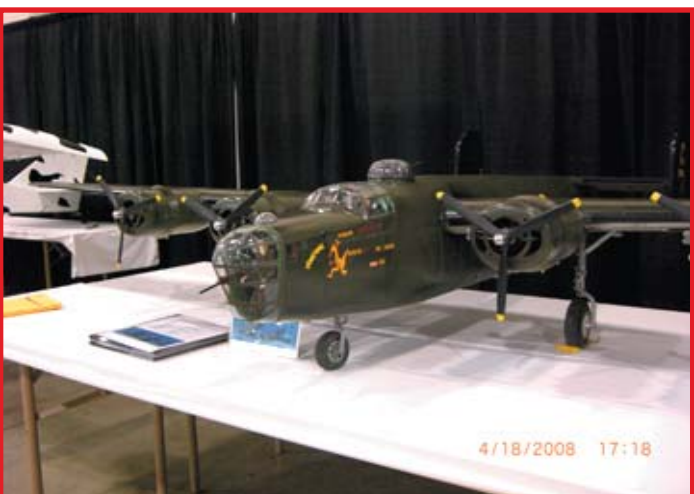
Jim Reed's big B-24 powered with 4 magnum engines. The B-24 drew attention, but Jim's not scale big Cow drew more attention from the kids and parents. Nicely done Jim.