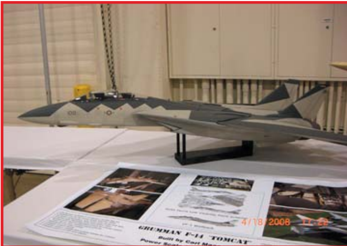
This F-14 Slope Soarer was built up from a Jet Hangar kit. The wings actually swing in flight. built by Chris Mas. Almost in the money because it was done really well.