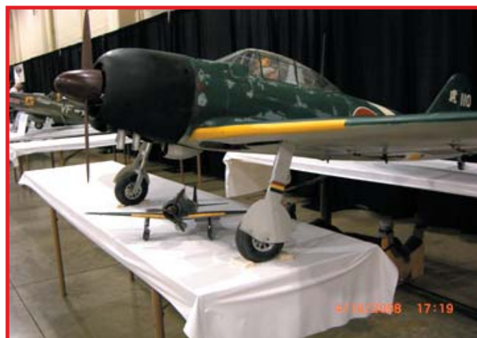
Brian Young's big A6M5 Japanese Zero built from a Mies-ter kit. Brian replicated the beat up look right from actual Japanese photographs.