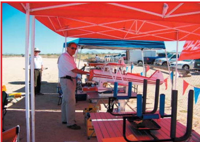
The comfortable Squadron pits at the One Eighth event. We had a great time and flew everything we hauled. No winds and the weather was perfect.