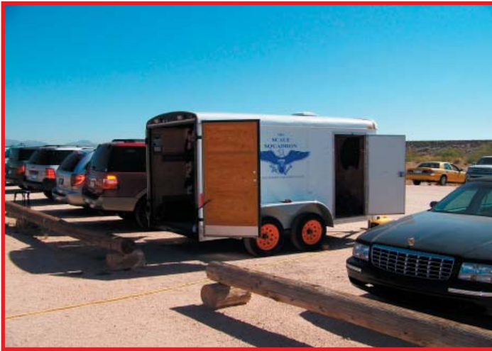
The club trailer in Phoenix. this was a dream to tow and the electric brakes worked perfectly. It hauled all our airplanes and gear over and hauled the famed Drag Queued P-47 back.