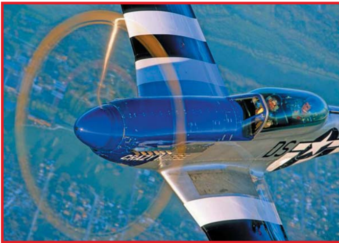
I just had to do it. A great air to air photo by Tom Smith of Stallion 51's Crazy Horse II. The P51T dual control bird. This is the plane that Wags got his P-51 sign off in. You can drive this hot rod for $3000.00 for an hour and you really fly it.