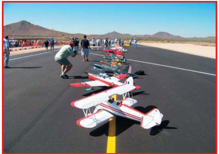
A sample of the noon lie up with over 70 pilots and possibly over 95 aircraft as many of us had more than one aircraft. Another smooth and fun event at the One Eighth. You can't miss the March event.