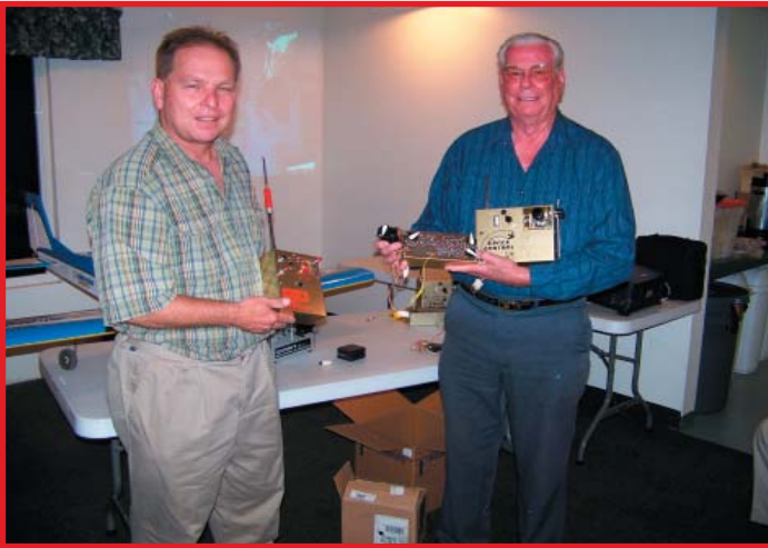
L-R: The September program had an interesting display of vintage radio control systems from days gone by and the history of many of them as they plodded into production. I do not have the names of these two fine gentleman.