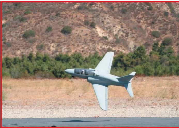
L-R: Without a doubt the lowest pass ever made. This is Sam's Bae Hawk right after a take off roll when the right gear hit a hole in the runway launching the plane before it was up to flying speed. Fortunately the gear came out of the wing and the nose gear was bent, but all is repairable.