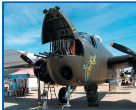
Barbie III B25 "H" Model. The only flying version of the 90mm cannon carrying B25 today.

on dates and time involved, it could be closed at times during repairs. It could be possible that help may be needed, so if O.C.M.A. should ask, please pitch in and help if at all possible, it's all of ours and we all use it, so we all should pitch in and help out. ( www.flyblackstarr.org ) As usual, it's been great to see all of the "Squadron Members" out at the field on Sundays, we always have a great time and