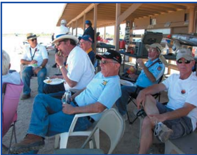
A small part of the pilots relaxing around lunch time at the one Eighth event.