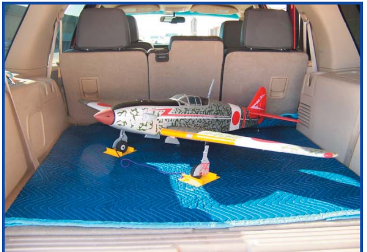
The new Kyosho EP 55" Ki-61 Tony fits in the back of your editor's Expedition nicely. Notice no oily rags!