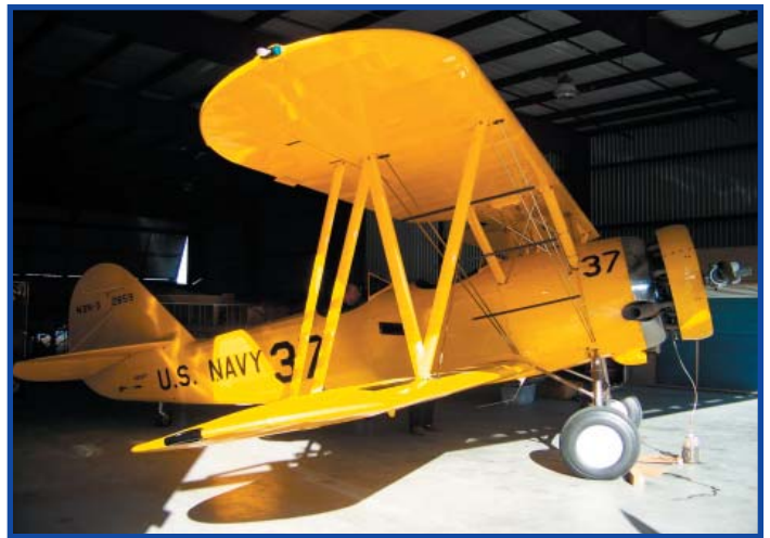
New N3N in the hangar. This is the Navy Yellow Peril, Now part of our hangar. If you need scale documentation, here it is in beautiful yellow. Full report at the meeting.