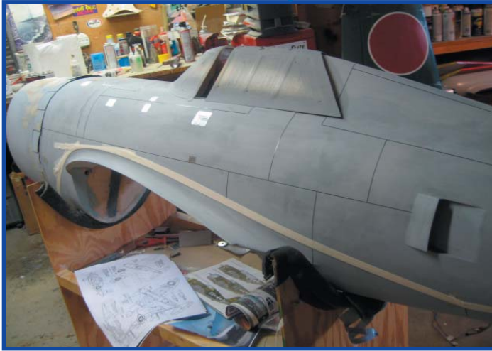
Brian Young's super sized P-47D built from Don Smith Plans. 140" wingspan. Left side panel lines and hatch plates applied.