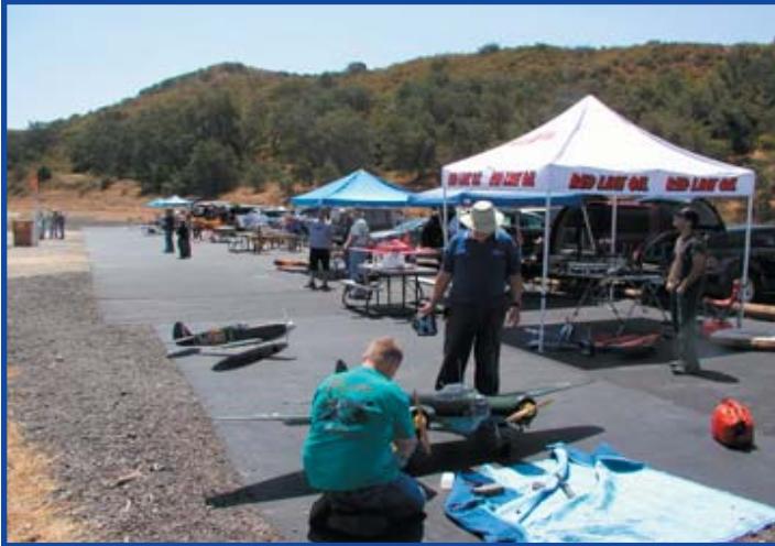
A casual scene at the OCMA Black Starr field on Sunday. The unofficial Scale Squadron flying day. If your not there, your missing out on a relaxing fun day.