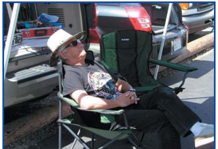
Your editor exhausted from punching this rag out. Just a hint of the relaxation and fun at the field on Sunday.