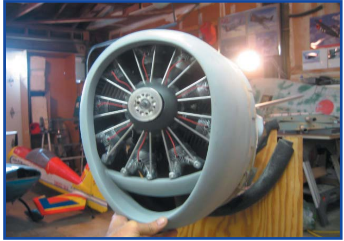
Ahhhhh.....behold the beauty. The dummy radial mounted in the cowl and fitted over the DA 150 engine. Always the tough part to avoid cutting the engine for motor parts, but this big cowl has plenty of room.