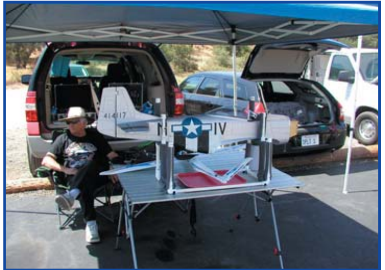
The new Kyosho 72" P-51 mocked up. A top cowl hatch was cut in for lithium batteries and a Neu motor. Yep, she is going to be electric powered with a 4 bladed prop.