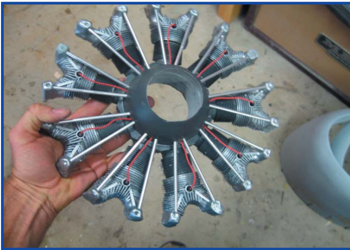
The dummy radial engine from Frank Tiano Enterprises. All resin and you need the weight up front. Brian added the pushrod tubes, paint and wiring.