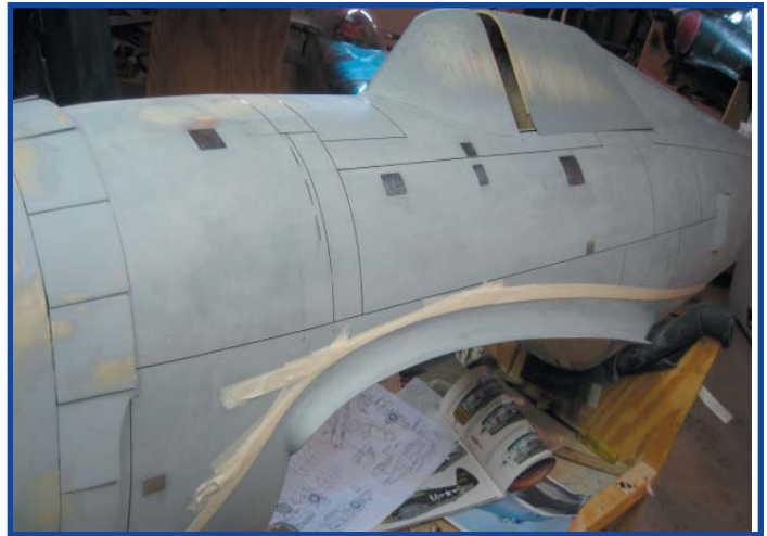
Right side front view of more panel lines. This is an all built up fuselage, no fiberglass except the cowl.