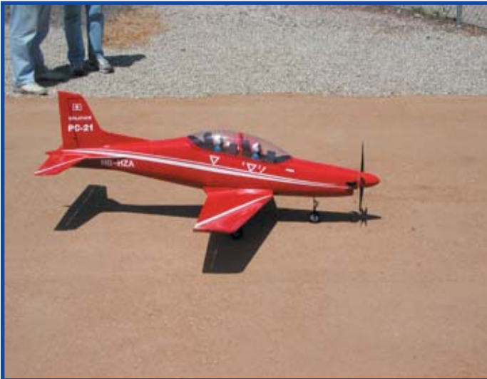
A really nice all wood build up Pilatus PC21 electric. 42" wingspan and it flew beautifully with a 4 bladed prop. The Pilatus is built from an Aerobel laser kit from Sweden.