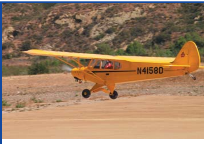
Gary Simlar's Dave Patrick Cub on a nice flyby. You can't beat a Piper Super Cub on a nice day at the field!