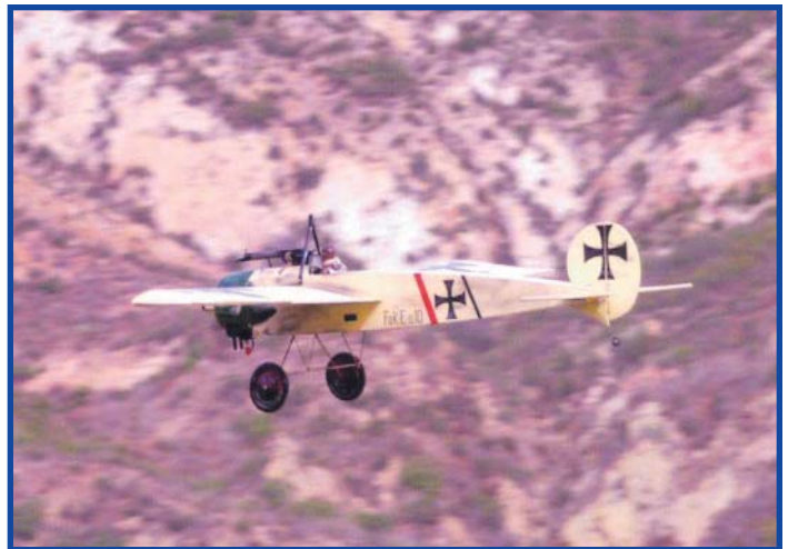
Gary Simlars Balsa USA Eindecker on a fly by at Black Star. Nice looking and flies really well.