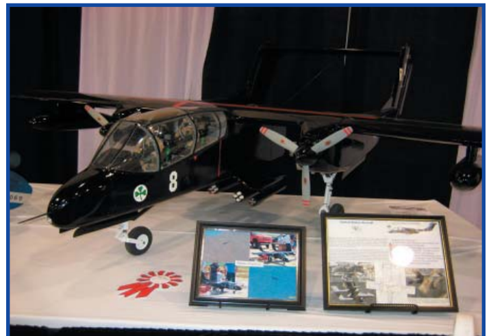
A scratch built OV 10 with a 108" wingspan, glow powered and Sierra retracts. Another winner at the RCX Expo.