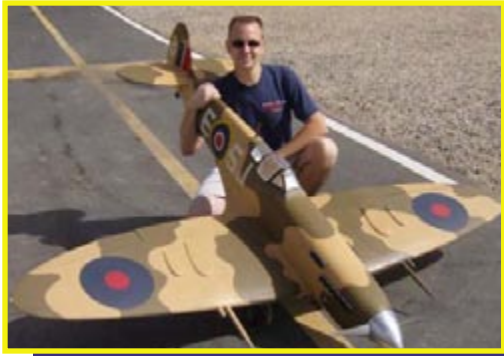
MY VIEW FROM THE BENCH