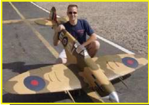
MY VIEW FROM THE BENCH