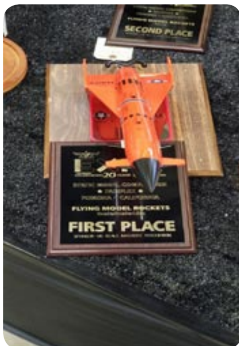
Another 1st place for this supersonic model and well done. The displays all looked great this year!