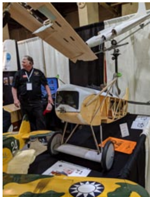
More cool planes on display in the Squadron booth. Lots of eye candy and plenty of reasons to build something!.