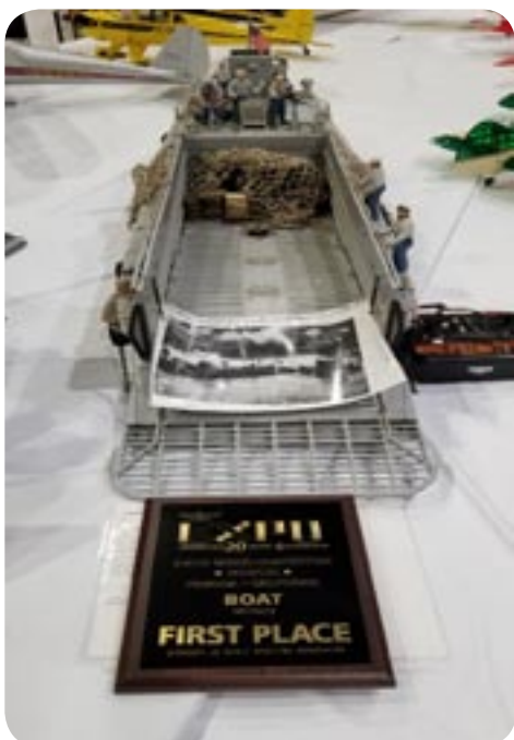
This landing Boat won't fly, but it is a work of art and took a 1st place, so in mind well worth mentioning.