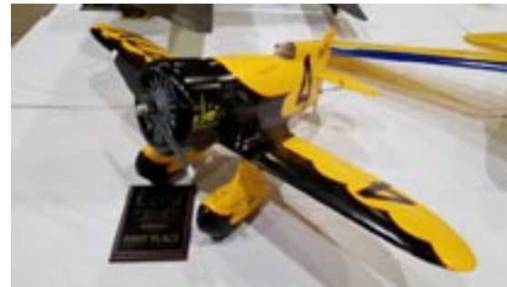
Another 1st place for this beautiful Gee Bee. I don't have the builder's name, but it looked great on display..