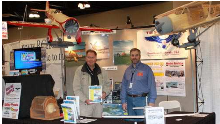
Squadron Booth Looked GREAT at AMA this year. Thanks to everyone for preparation, setup, display, Manning the booth and Teardown work! It was a team-effort.