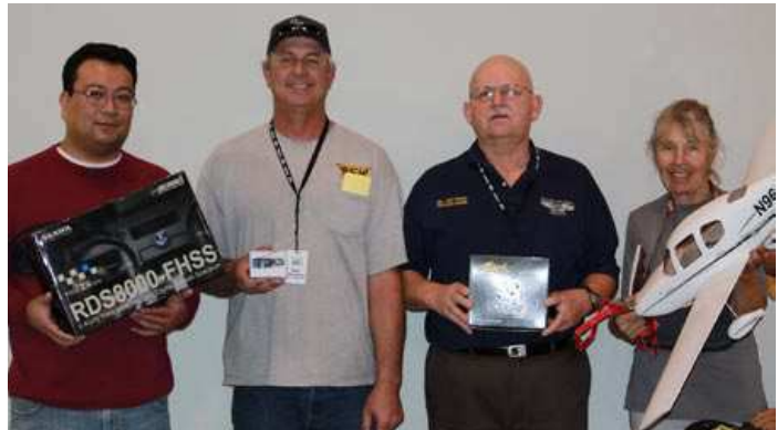
Some winners from the Squadron AMA Show Raffle. It was a hit and a Great Fund Raiser for the Club.