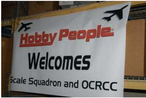
Hobby People Night OCRCC and Squadron