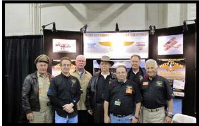
RCX Sunday Crew

But a static display, even a beautiful one, can be pretty boring if it's not interactive. This is where the Squadron really shined, bringing our passion for Scale Aviation to life. The volunteers (all donning either our now "staple" black