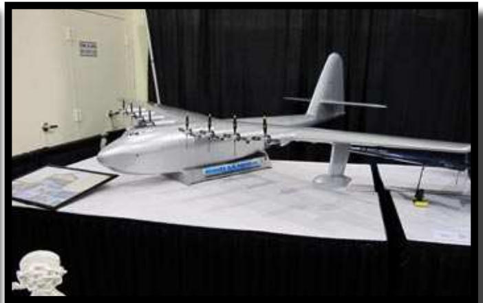
Hemet Model Club: Spruce Goose.