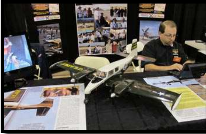
Scale Squadron/ModelAirplaneNews: Alien Aircraft Cessna 310 Review Airplane