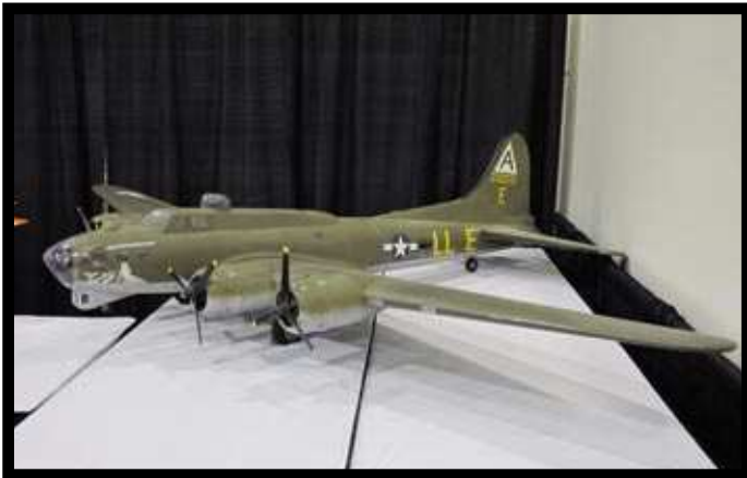
Mike Greenshields/Hobby People: ASM B-17 Flying Fortress