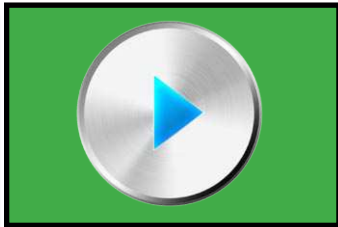
Cambrai Tiger Meet Airshow 2011. *50 minutes