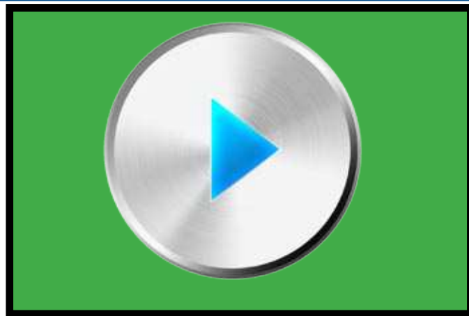
Duxford Spring Airshow Highlights 2011