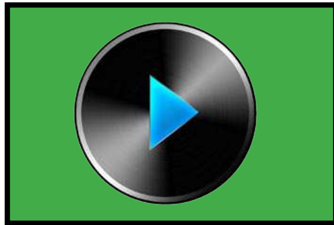
Lucas Films has created a good looking movie called "Red Tails". Here is a preview of the movie