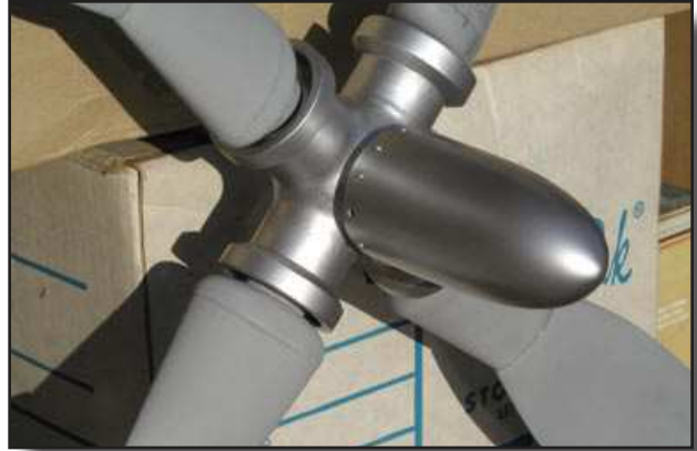
A nearly completed scale P-47 prop by Gordon Truax for Brian Young's P-47