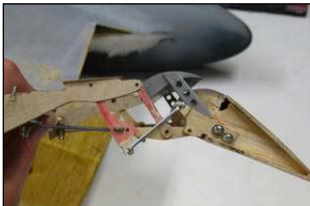
This is the flap in the down position. Take note to all of the linkage to help the flap operate