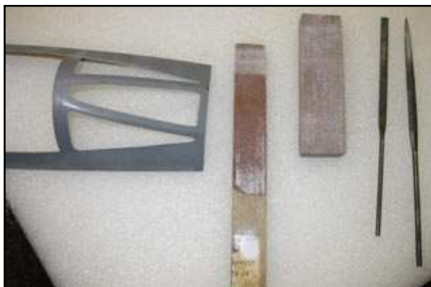
This is the same canopy fully cut out. Take not of some of the tools used to prep all of the cut lines.