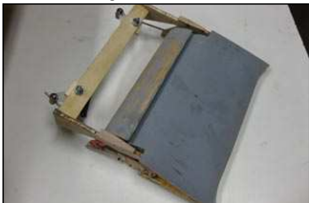
Here is a top view of Larry Wolfe's A-26 flap.