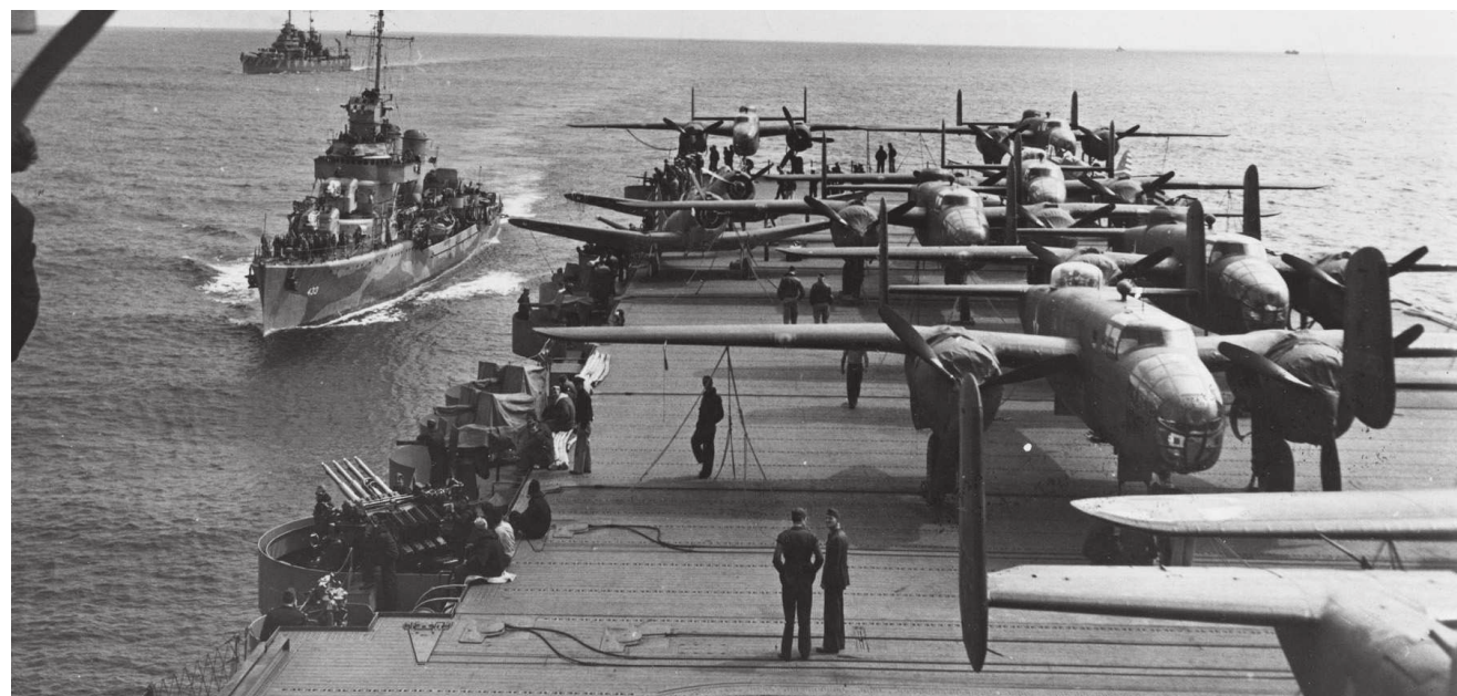
Jimmy Doolittle Raiders

The next Squadron newsletter will contain detailed information about this airplane for your reading pleasure.