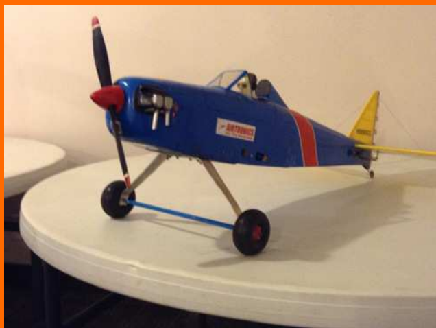
Top Left: Chris Greenshield's Fly Baby back from the grave with Cub Wheels.