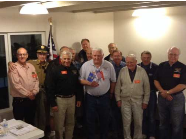
Above: Squadron Member Veterans were thanked for their service at the November Meeting.