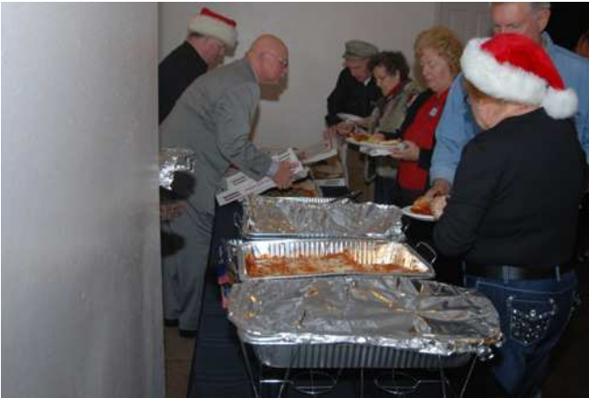
Above: Squadron members get food at the 2012 Christmass Party.