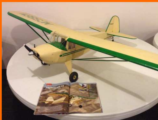
Middle Right: The club project Taylorcraft and the article published about it in Model Airplane News.