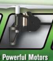
4 Powerful Motors