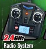
2.4GHz Radio System