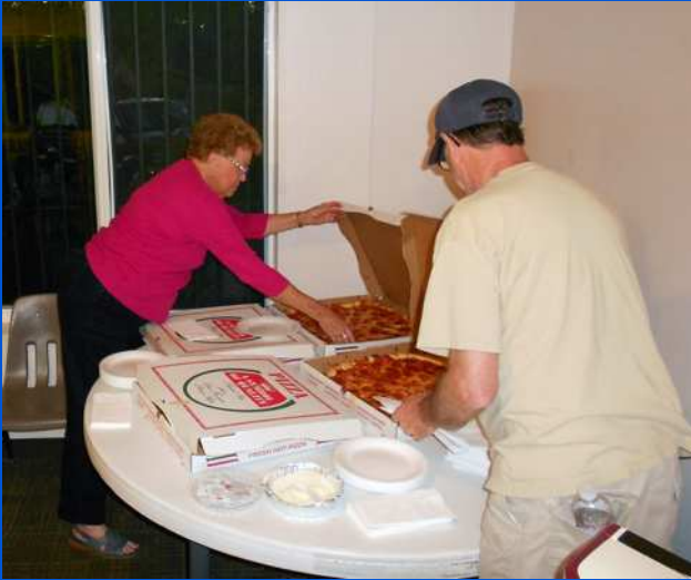
May was Free Pizza month! What a great meeting!