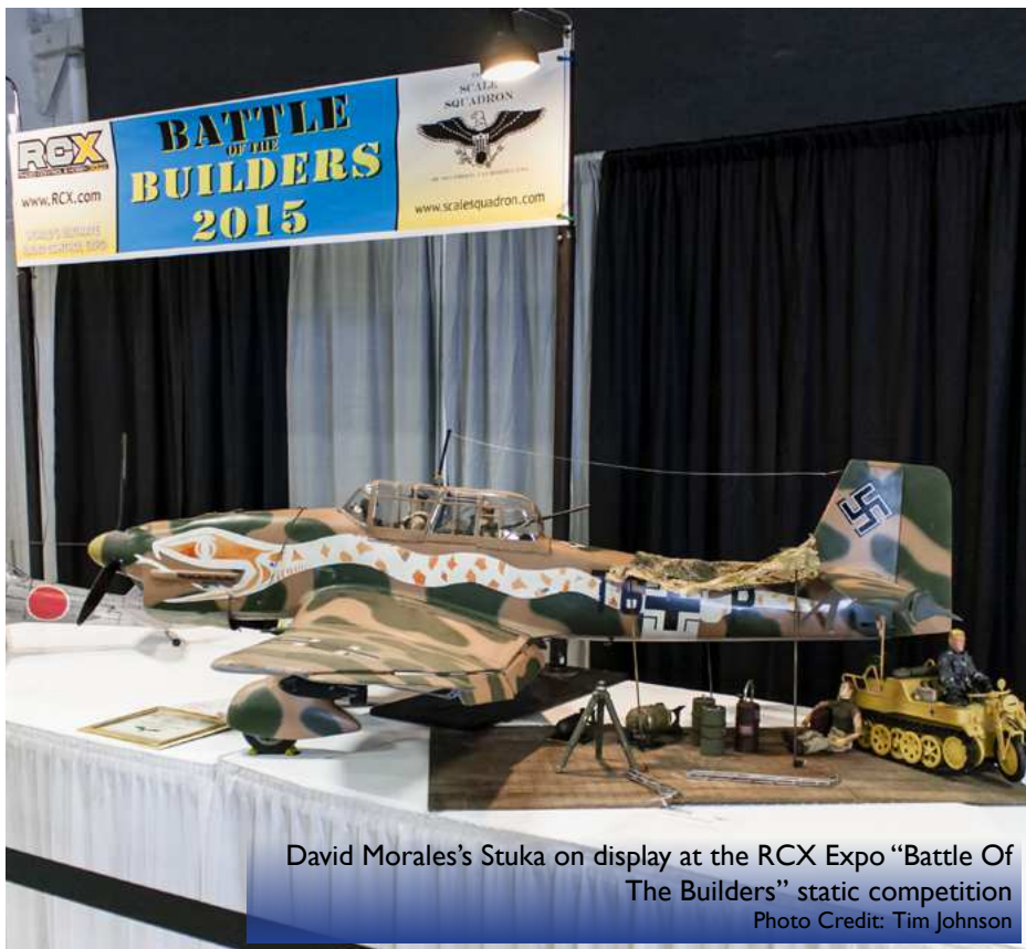
David Morales's Stuka on display at the RCX Expo "Battle Of The Builders" static competition