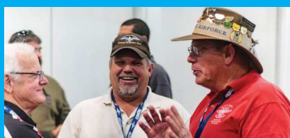
Meeting of the minds for the U.S. Scale Masters at the AMA Expo