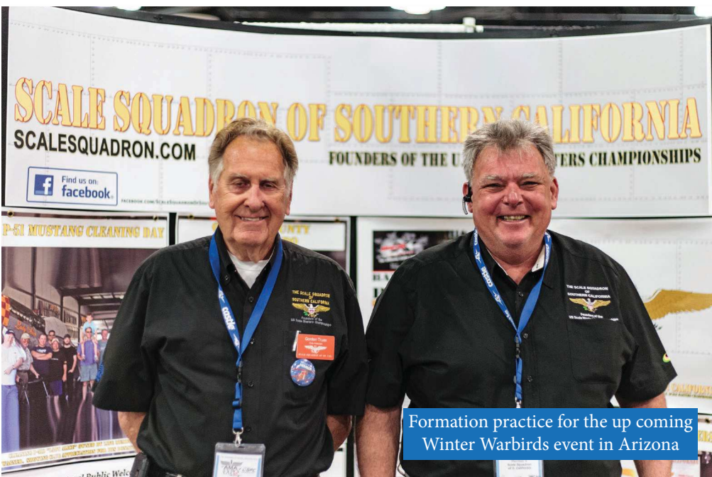
Formation practice for the up coming Winter Warbirds event in Arizona