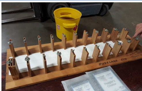
Here is a more detailed view of Larry's building jig.