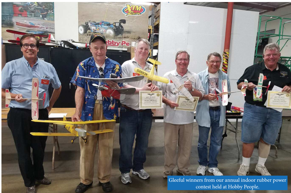
Gleeful winners from our annual indoor rubber power contest held at Hobby People.