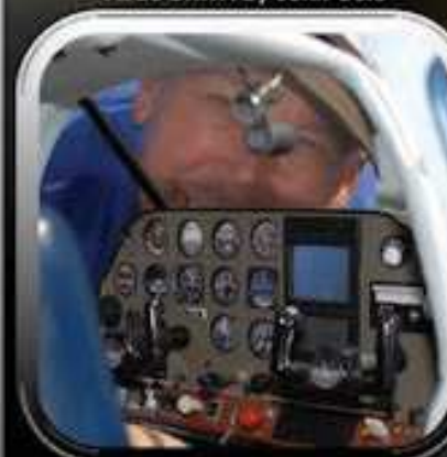
Bellanca Super Viking by Dave Lovitt